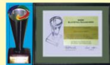
Certificate of Achievement for usage of Troyee by honorable Customer awarded by BASIS