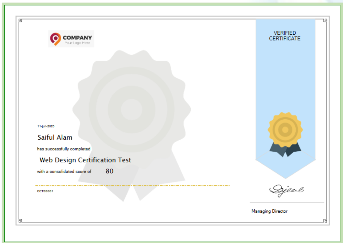
Figure 1.2: It shows learner certificate with course name, obtained scores and engraved signature.

A learner can take part in Certification Tests. After giving an exam, the certificate will generate automatically for the user.